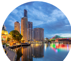
DISCOVER ILSC BRISBANE