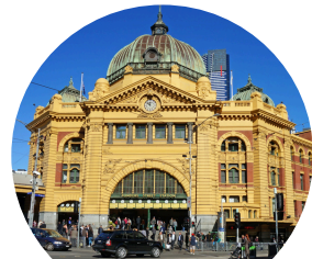
DISCOVER ILSC MELBOURNE