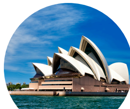
DISCOVER ILSC SYDNEY