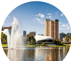
DISCOVER ILSC ADELAIDE