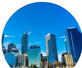
DISCOVER ILSC PERTH