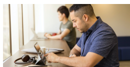
Cambridge English (FCE, CAE, CPE)